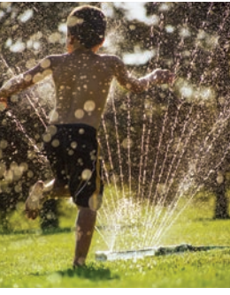
WATERING RE-STRIC-TIONS for Becker are being enforced due to the dry conditions. See our story on page 10 for the city regulations.

Becker News Baseball for adults is back for the summer. The Bandits, Buzzards and Lakers have been playing games since early June. For the youngsters, registration for the late summer baseball season is currently open! See stories on page 12.