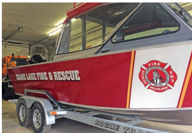
ONE OF SCHMIDT'S completed projects, the Crane Lake Fire Dept.'s new fire and rescue boat. (Submitted Photo)

Schmidt is currently creating the new door sign for the Patriot's offices. Contact him for sign and design needs at 218-235-0444.