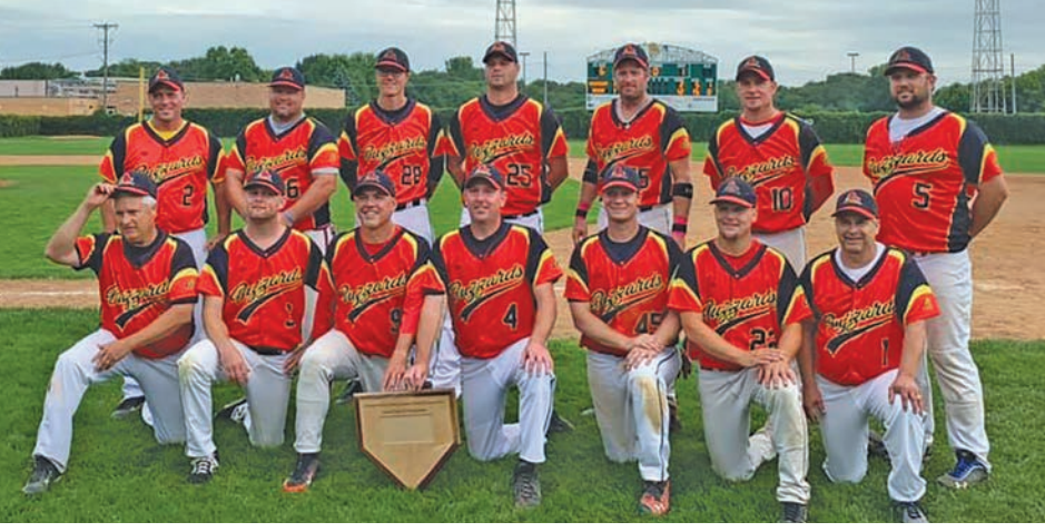
THE BUZZARDS pose for a team photo last year.

Several central Minnesota area amateur baseball games have been canceled in the past week due to concerns of potential Covid exposure by team members, but as of now no confirmed reports have been verified.