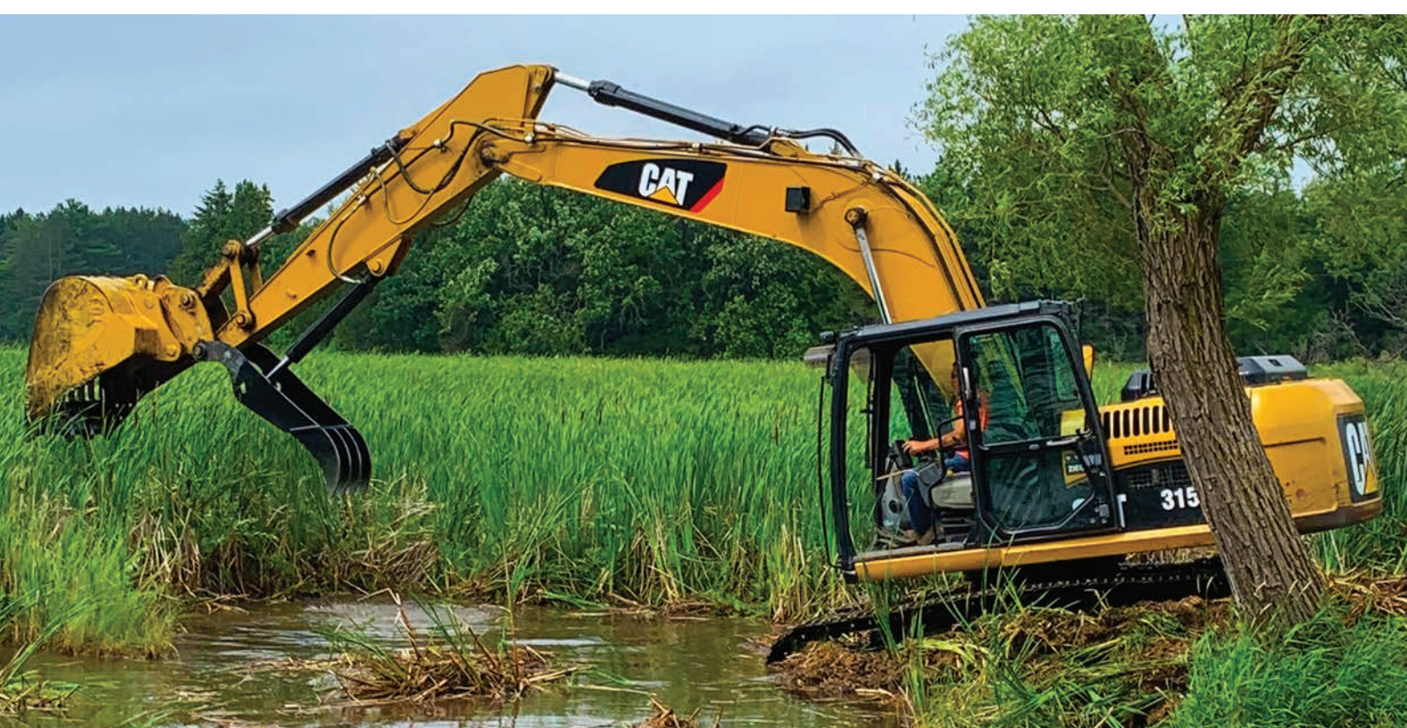
AN EXCAVATOR TAKES A CHOMP out of a piece of the bog that floated into Nixon Lake's boat landing and beach near Clearwater on Tuesday. See complete story and more photos in next week's Patriot.