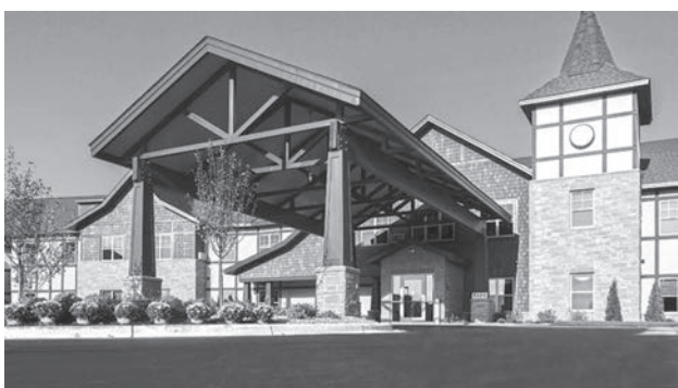
GUARDIAN ANGELS, a nonprofit senior care provider operating throughout the region, is pursuing financing for a $30 million senior housing expansion in Albertville and requested that Becker serve as the issuer of tax-exempt notes.

The Becker City Council convened on Tuesday, Nov. 8, for a meeting that centered on two key topics: a request for the city to issue conduit debt for a senior housing expansion in Albertville and updates to personnel policies to align with Minnesota's new Paid Leave program. Conduit Financing The meeting began with an overview of conduit financing provided by an attorney with Dorsey. He explained how cities can legally assist nonprofit organizations by issuing tax-exempt debt on their behalf. "Cities are allowed to issue tax-exempt debt," he said. "They can offer that tax-exempt debt to 501(c)(3) nonprofits." It allows qualifying nonprofits to access lower-interest, tax-advantaged borrowing without placing financial risk on the issuing city. Essentially, the organization, not the city, is responsible. That organization is Guardian Angels, a nonprofit senior care provider operating throughout the region. They're pursuing financing for a $30 million senior housing expansion in Albertville and requested that Becker serve as the issuer of tax-exempt notes—distinct from bonds—o support the project. These conduit notes would flow through the city of Becker solely to secure