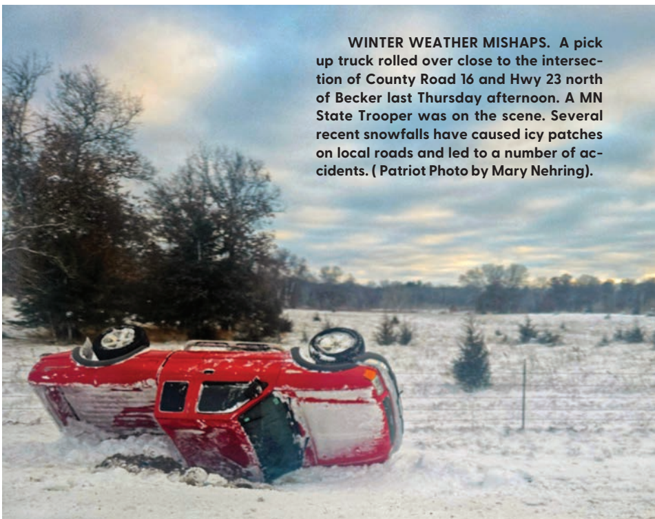
WINTER WEATHER MISHAPS. A pickup truck rolled over close to the intersection of County Road 16 and Hwy 23 north of Becker last Thursday afternoon. A MN State Trooper was on the scene. Several recent snowfalls have caused icy patches on local roads and led to a number of accidents.