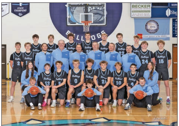
THE BECKER BOYS BASKETBALL TEAM is looking for its first conference title since 1994.

Nuest, and Sawyer Brown — who bring leadership, scoring balance, and defensive toughness.