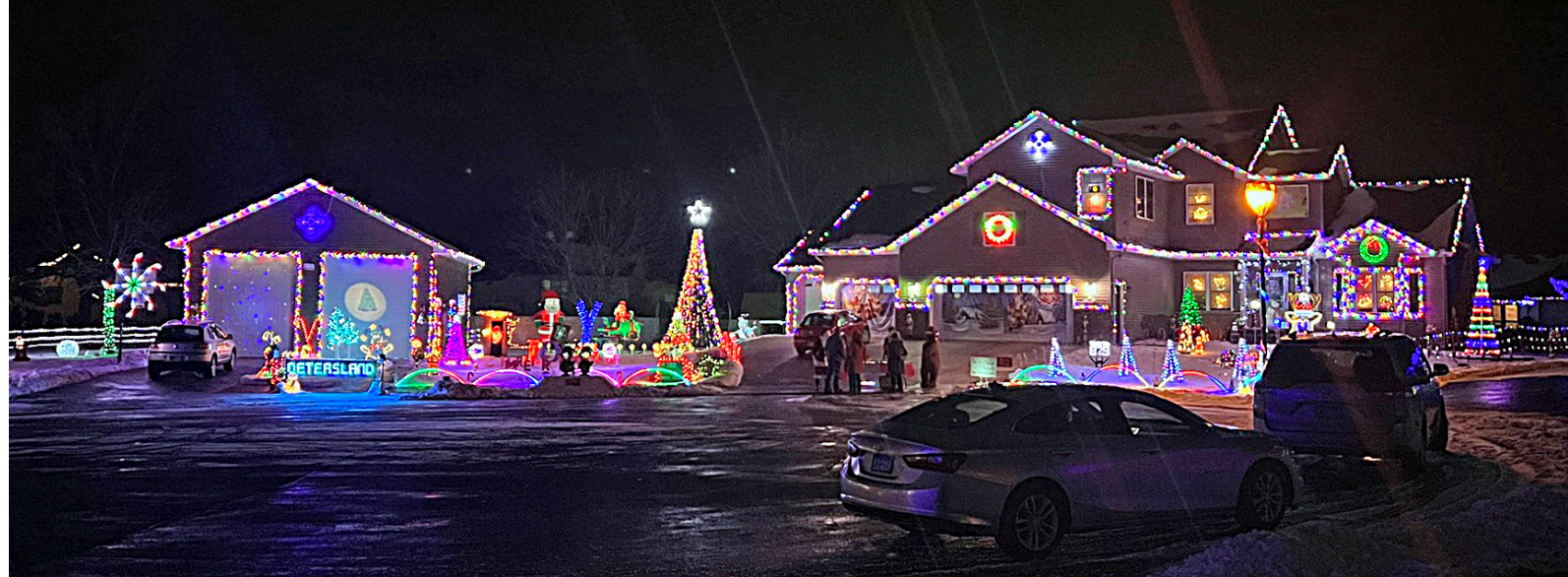
THE DETERSLAND LIGHTS PROPERTY has over 25,000 lights that would give the Griswold family supreme envy (Submitted photo.)

Four homes and two businesses Becker Community Center and Becker Parks & Recreation. Voting has ended as of this week but people of holiday cheer can still