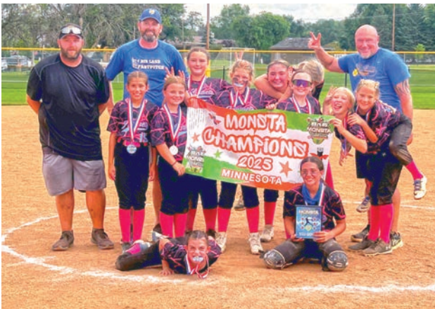
THE BIG LAKE 10UA FAST PITCH SOFTBALL TEAM showed their delight as they posed for a photo following their championship win in the Monsta Nationals Gold Tournament in Bloomington last month. (Submitted Photo).