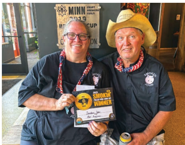
THE FIRST PLACE TEAM, SMOKEN' JOHN was presented a certificate and a prize envelope.