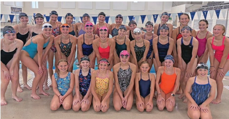
THE BECKER SWIMMING AND DIVING TEAM again has strong numbers and numerous top performers.

took third in Sections, their highest finish ever. Now,