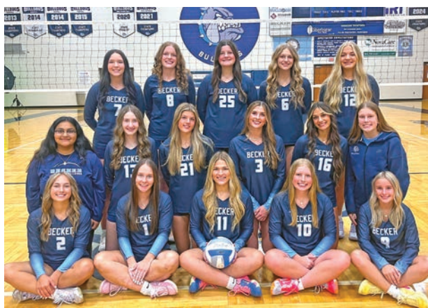
THE BECKER BULLDOG VOLLEYBALL TEAM will have a wealth of experience on the court, with numerous returning letterwinners ready for action. (Submitted Photo.)