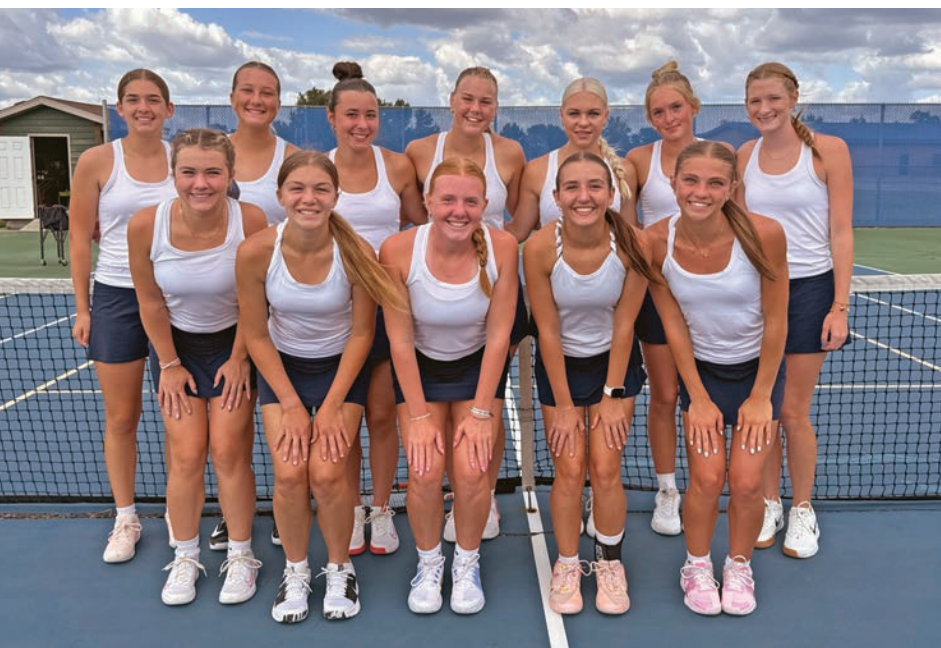
THE BECKER GIRLS TENNIS TEAM is off to a great start this year and features a deep and talented lineup.